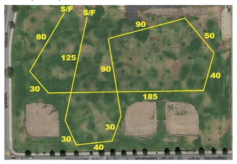
CCA reserves the right to alter course plans as necessary.